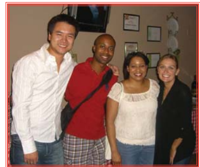
2010 Mid Year Retreat Scottsdale, AZ

Ad2 Nashville has been active and gaining new members. We just got back from the National Ad 2 Mid Year Retreat in Scottsdale, AZ and we are now ready to reevaluate our goals as we hit the mid-year point and see what the new year brings.