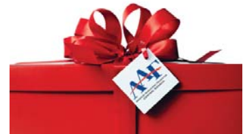
November's Gift of Advertising

Fundraiser: Lastly, AAF Central Georgia is planning its first fundraiser of the year. On December 9, we will be hosting a Media Auction. Our board members have been working very hard planning and soliciting donations. We are hoping that the funds raised will help offset the cost increase of our ADDY Awards. It is sure to be a huge success.